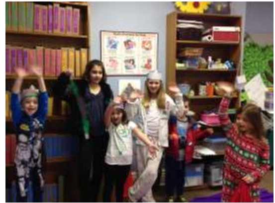
K-5th grade students read Matthew 21 and learned about Jesus' triumphant entry into Jerusalem. (P.S. it's pajama day)

A big thanks to all of our kids who participated in the March Challenge . Seeing you in the pews each Sunday was so wonderful... and we can only imagine the size of God's smile as you worshipped Him each week! You did a fabulous job reading prayers and scripture, greeting our congregation, and collecting the offering. You are a special part of our church!