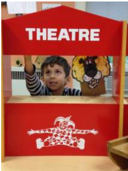
Sunday School students learn about Noah and the ark through a puppet show.